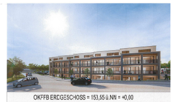
OKFFB EREDESCHOSS = 153,55 u.NN = +0,00