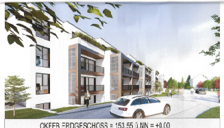
OKFFB ERDGESCHOSS = 153,55 d.N.N. = +0,00