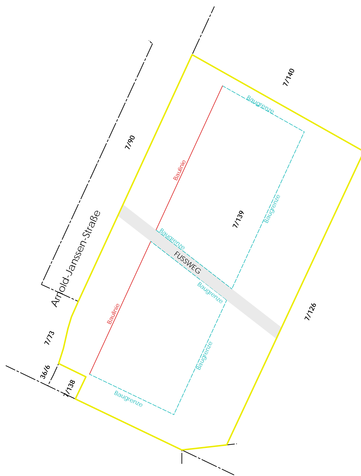
ALTE PARZELLIERUNG - M 1:500 -