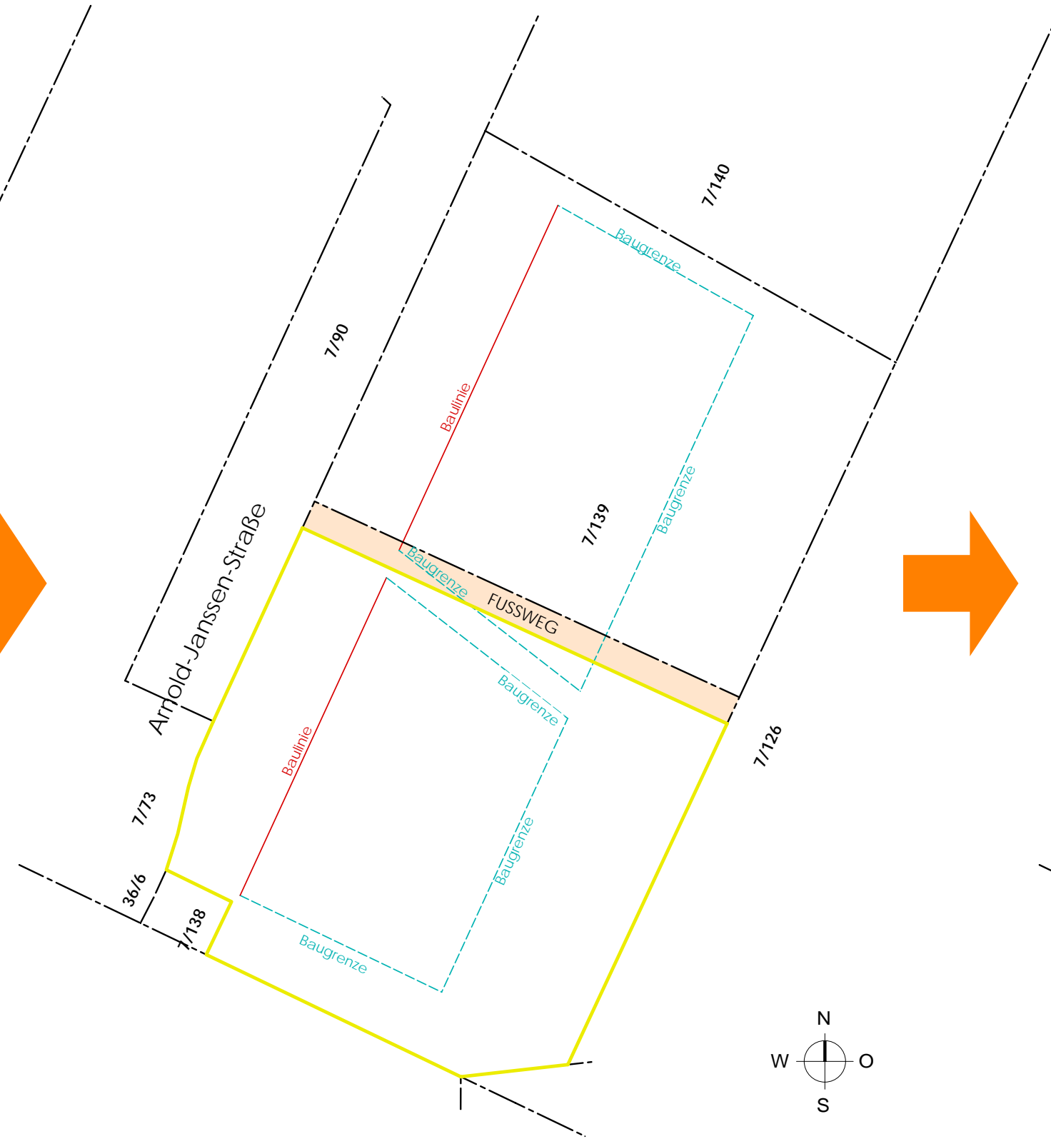
NEUE PARZELLIERUNG - M 1:500 -