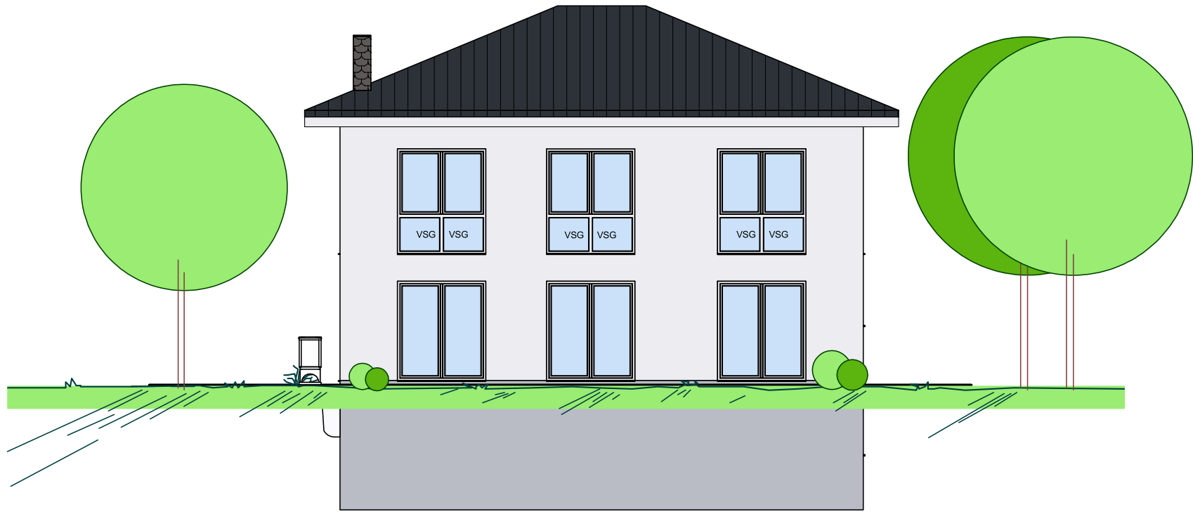
Ansicht 1 23.01.2020