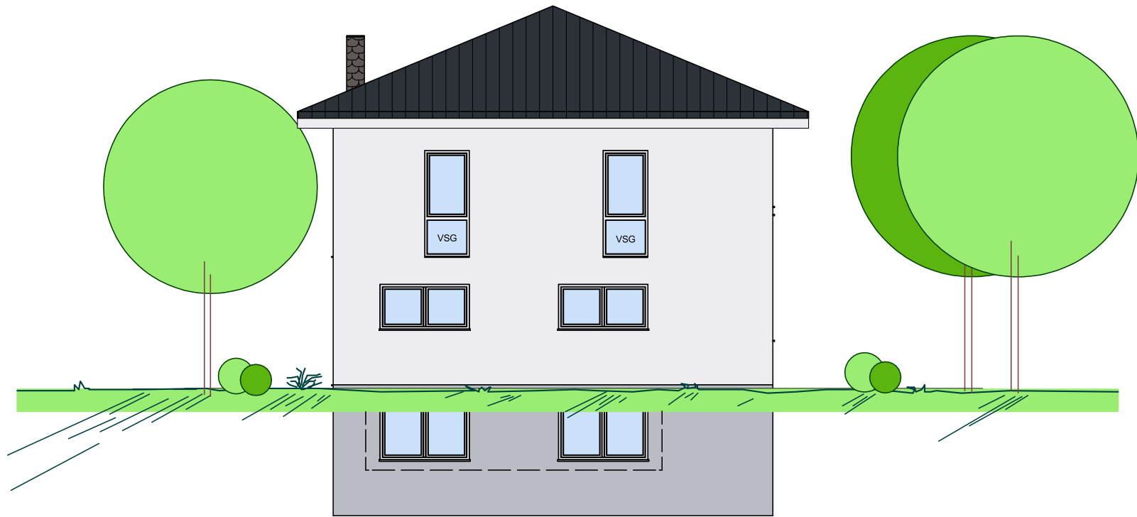
Ansicht 4 23.01.2020